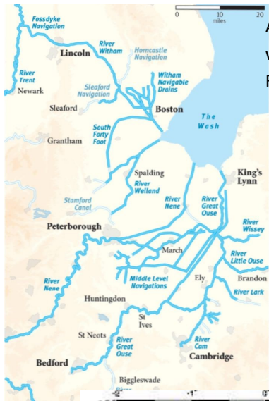
A map showing the waterways in The Fens.